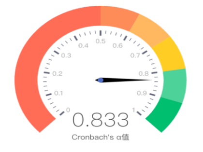
Figure 1 Reliability analysis general diagram.